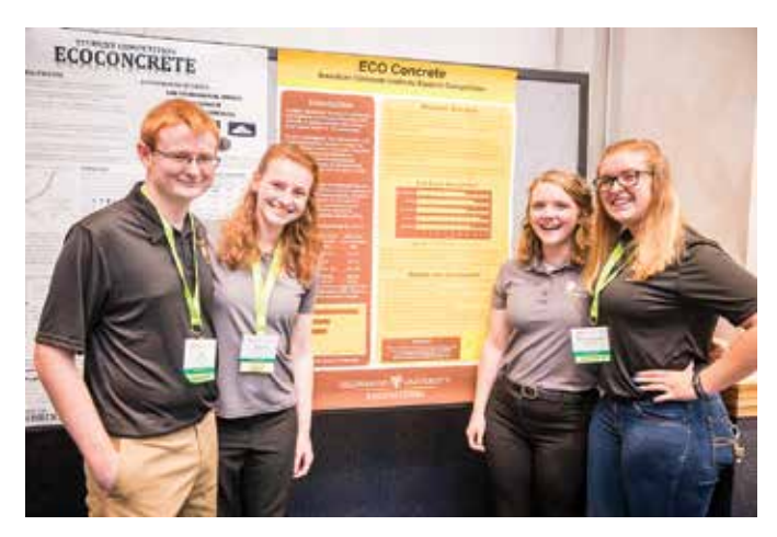
This year, new ACI Foundation fellowships and scholarships are available to support students with aspirations of concrete-industry careers

about all ACI Foundation awards for concrete scholars, visit www.acifoundation.org/scholarships/fellowships.aspx.